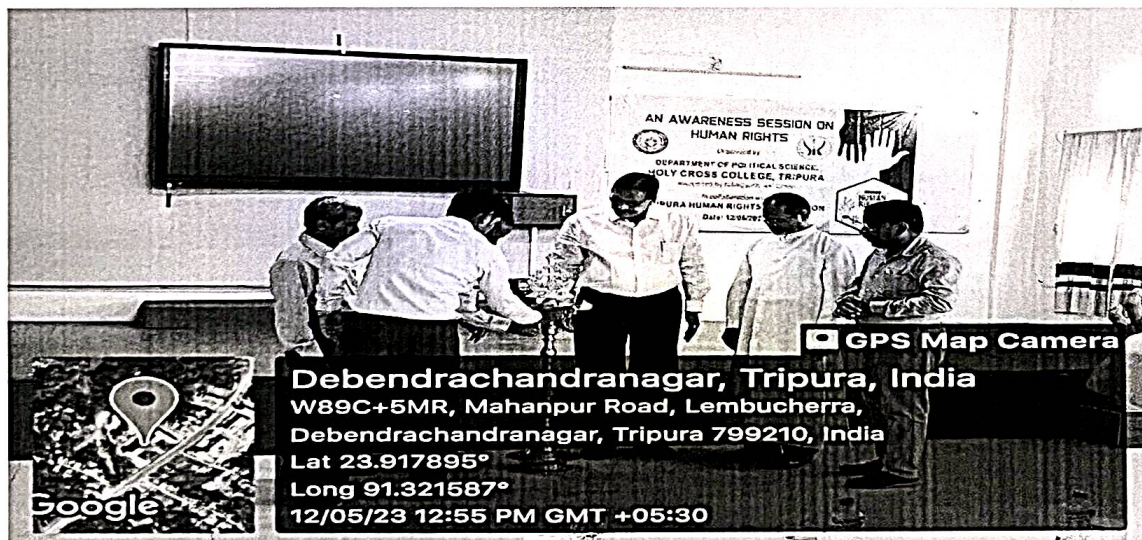
Inauguration of the session by Principal and the dignitaries