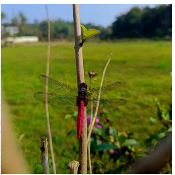
Dragon fly Joint first prize owner.

HOLY CROSS COLLEGE (An ISO 9001:2015 certified institution) Tripura Central University Reg. Code: 17 Jubatara, P.O. Lembucherra, Mohanpur Road, Tripura (W) Pin - 799210 Phone: (0381) 286 5222 / 09402315672, Fax: (0381) 2342572 E-mail: principalhccagt@gmail.com Web: www.holycrosscollege.in