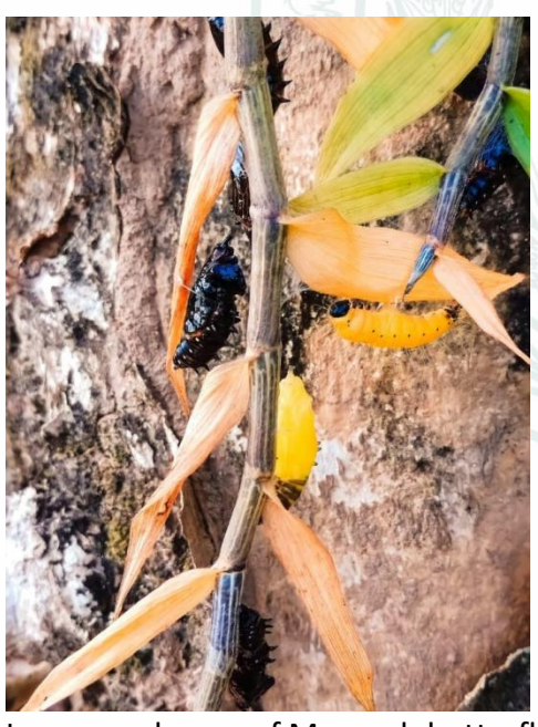
Larvae and pupa of Monarch butterfly Second prize winner.