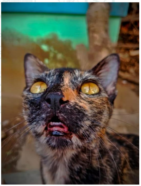
Felis catus Third prize winner.