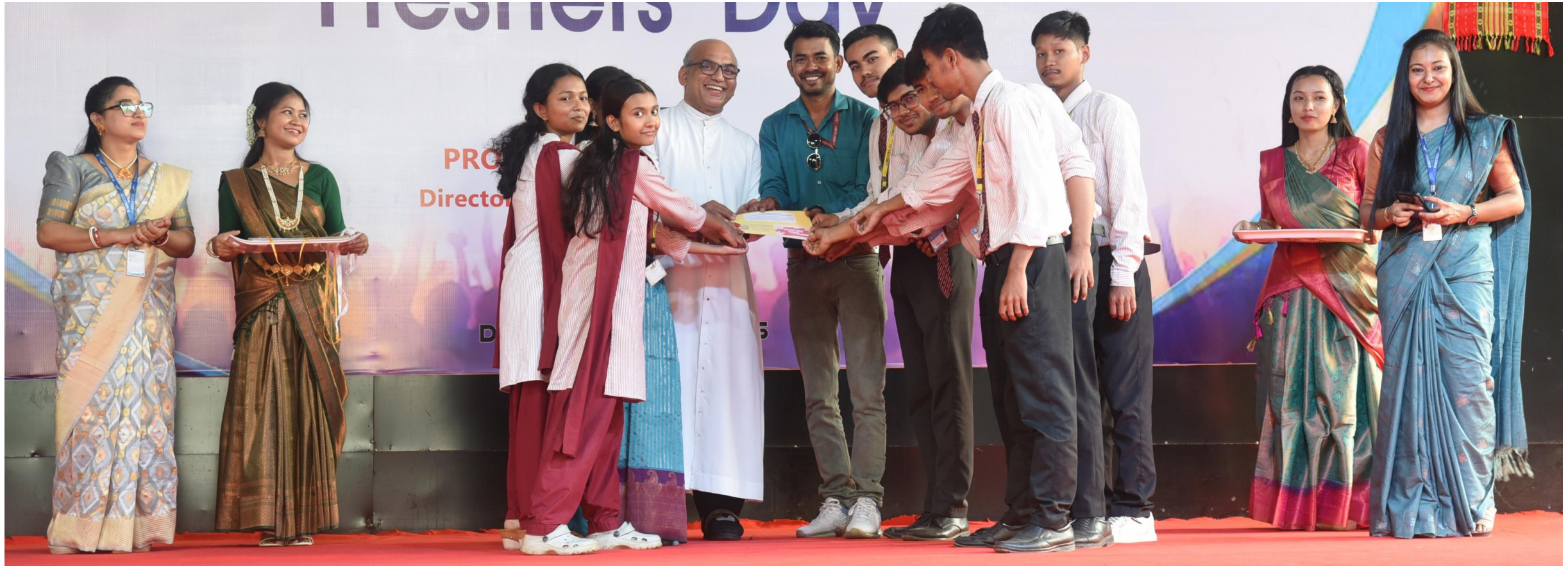
Prize received for Sustainable Creations - A hands on Workshop on Eco Art and Prototype / Process Design organised by Eco & Nature Club, in collaboration with IQAC, IIC, and Department of Business Administration, Holy Cross College, Agartala on 23 March, 2025